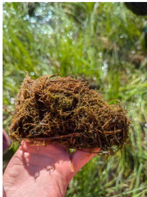
Winning Photo - 2026 CJSS Photo Contest

I took this photo near Cold Lake during my PhD fieldwork. My research is addressing how we can clean up contaminated soil and water using a carbon-rich material called biochar. This site is a peatland that has been contaminated for nearly 20 years. Before my first field trip, I expected to see a barren, damaged landscape. Everything I had heard about the site led me to imagine a place where nothing could survive. But I was surprised. The site was green and alive; grasses, mosses, and even willow trees were growing, despite the contaminated soil beneath them. Standing there, I felt a quiet sense of awe. It reminded me that life doesn't give up easily. Even under long-term environmental stress, it finds ways to adapt and persist. As a soil science student, this experience deepened my belief in the importance of remediation. On a personal level, it also stayed with me as a lesson, that even in difficult or uncertain times, growth is possible, and resilience can slowly take root.